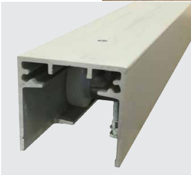
CS SofStop track and carriage.