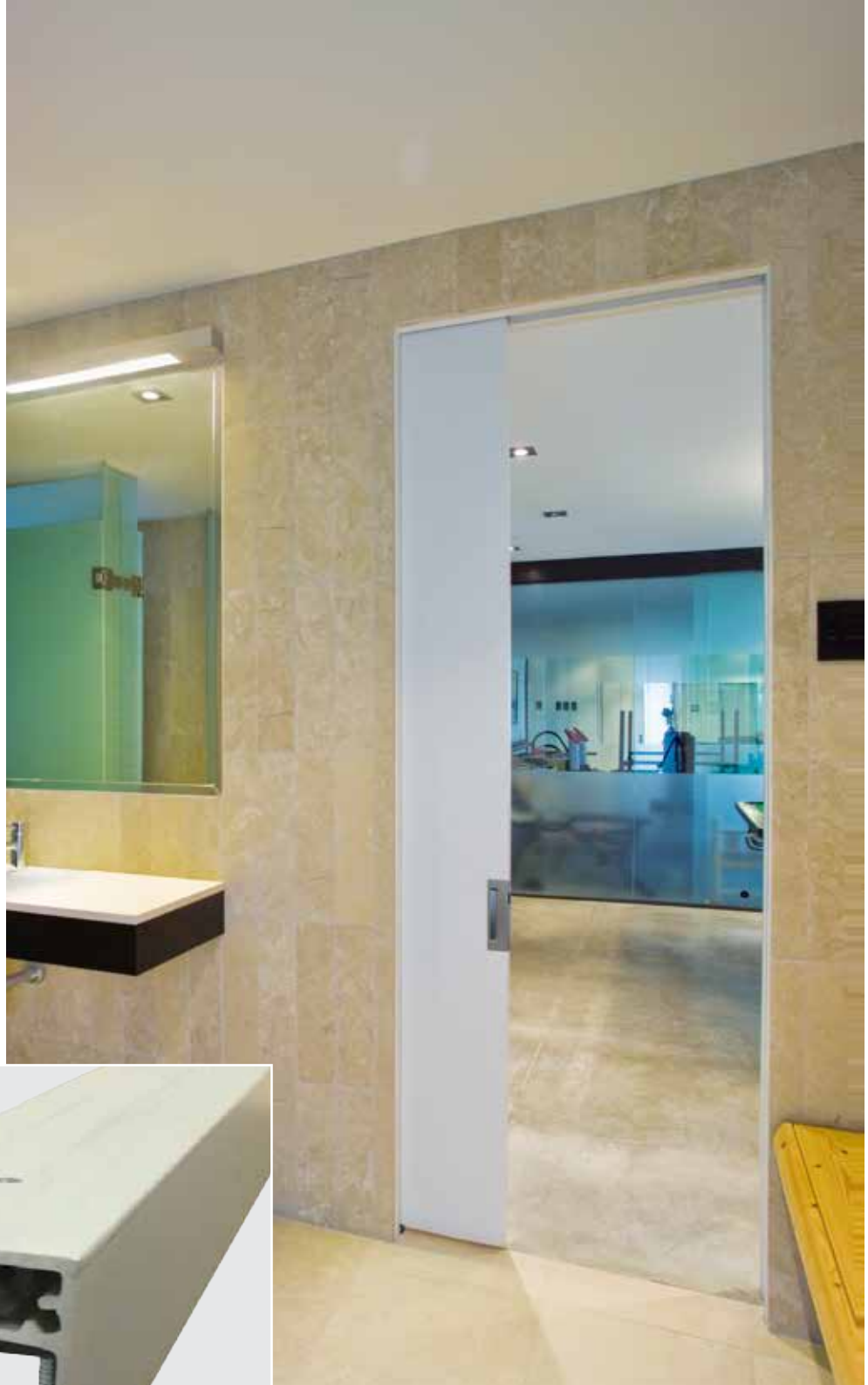
Pocket door with CS SofStop and CL400 Magnetic handle.

Engineered to stop doors up to 80kg (176lb), the CS SofStop is a must-have wherever quiet and safety are priorities. This system is the ultimate in style and sophistication.