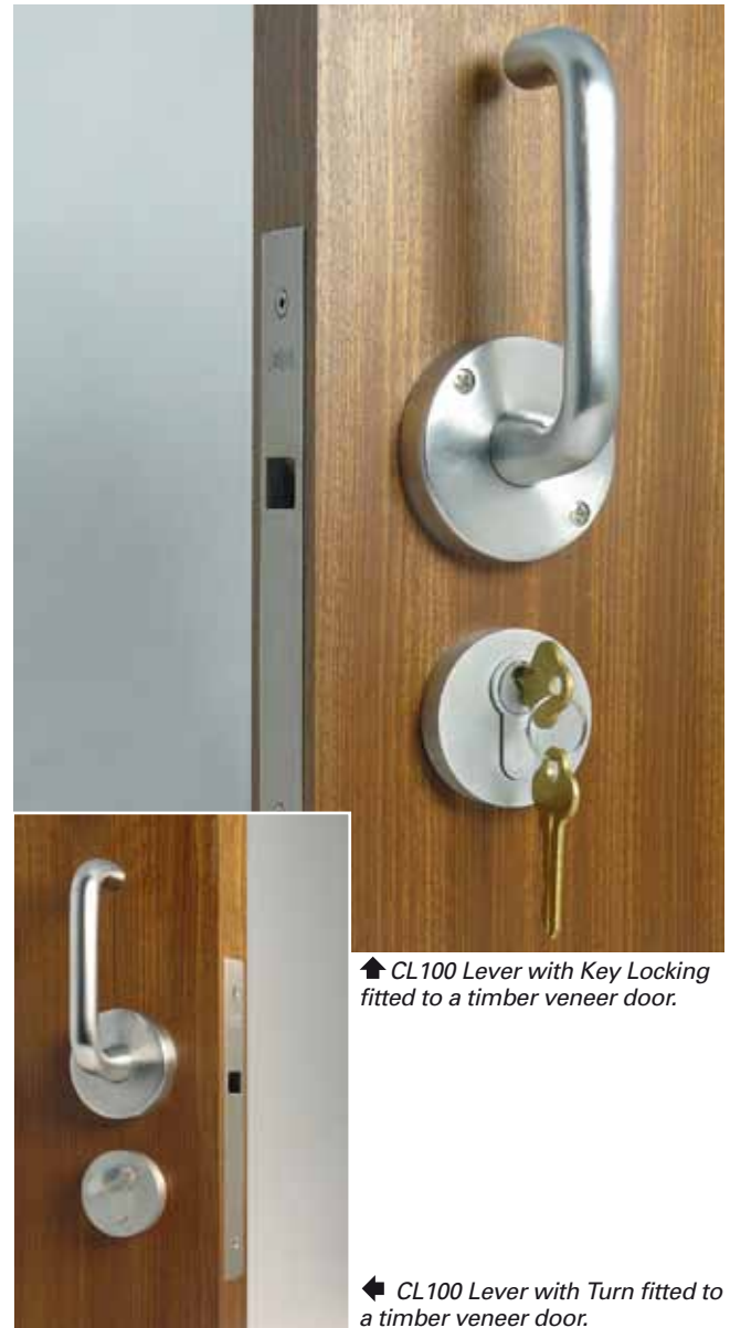
↑ CL100 Lever with Key Locking fitted to a timber veneer door.